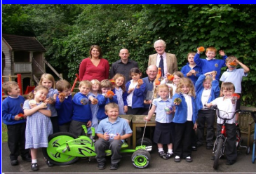
Gifts of toys and equipment to stimulate language and learning.

Unless you have indicated a particular use for it (see below), we will use your gift towards our priority programmes and to meeting applications for grant aid from families, health centres and schools that support children with special needs within the community.