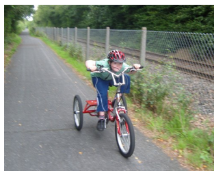
A specialist tricycle makes a real difference.

To make a will or an amendment to an existing will is straightforward and less expensive than you might think. We strongly recommend always using a professional legal advisor such as a solicitor when drawing up such an important document.